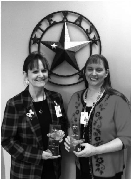
Grayson Cnty Tax Office Employees of the Year