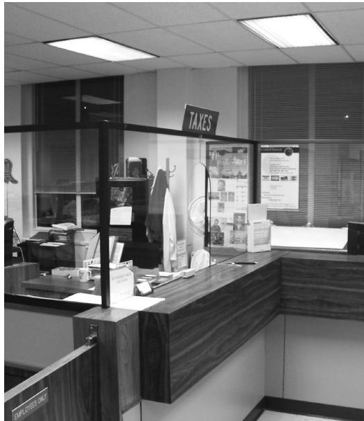
Grayson Cnty Tax Office Before Remodel