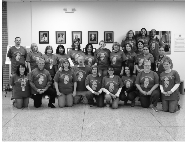
Guess what day it is in Tarrant County.....You guessed it; it's HUMP DAY!